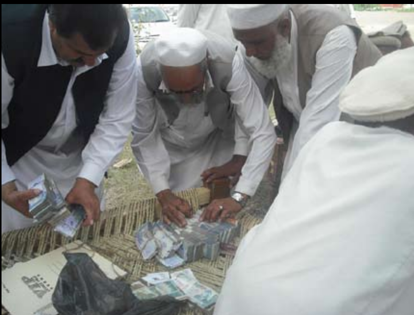
Distribution of compensation to victims of the bombing in Sra Vela, Tirah Valley, Khyber Agency.

While such an apology, as well as the compensation provided by the PA and military, should be applauded, the delayed response and circumstances of the initial compensation—specifically the military's denials while the PA was already paying compensation—raise serious concerns. It suggests that in the absence of intense public scrutiny and pressure, the Pakistani army does not feel the need to formally apologize for civilian casualties or acknowledge the losses civilians suffer as a result of its operations.