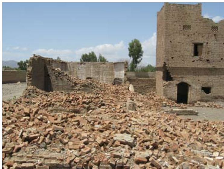
House destroyed by drone strike

US drone strikes are a unique form of conflict-related violence in Pakistan. Strikes occur without any warning and are often outside areas of ongoing Pakistani military operations. Many locals refer to the drones as bangana —a form of the Pashtun word for “wasp,” in reference to the ubiquitous buzzing sound of the drones.